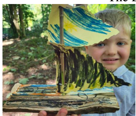
The EYFS Team

Their confidence and maturity shows they are developing into interesting characters and they are always eager to try out new things. They have had so much fun this term and we are delighted with the fantastic year we have had together. Well done Class R and good luck in Year 1.