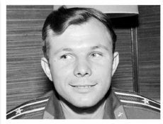
First human in space (USSR) Yuri Gagarin April 1961