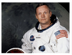
First person to step on the Moon (USA) Neil Armstrong July 1969