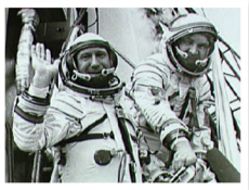
First spacewalk (USSR) Alexey Leonov March 1965