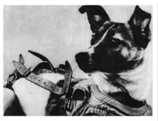
First animal in space (USSR) Laika the dog November 1957