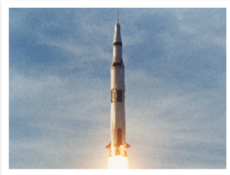
First manned spacecraft to orbit the Moon (USA) Apollo 8 December 1968